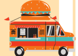
4th Saturday Food Truck Rally 2 - 7