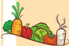
Tuesday Evening Market 3 - 8