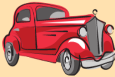
Tuesday Night Car Show