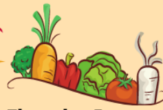
Thursday Farmers Market 3 - 8