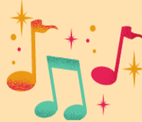
Tuesday Summer Concert Series 7 - 8:30